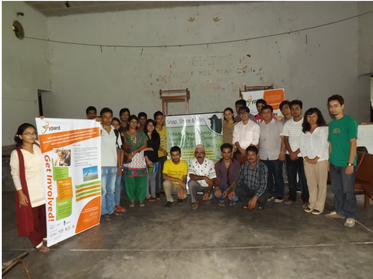
(Picture: Program organized in Agriculture and Forestry University (AFU) for announcement of contest.)