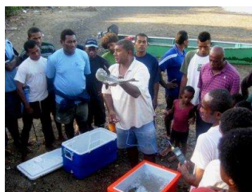
Training of youth in sea safety and fish handling in Kubulau district

Recognizing that young people will not be able to fully express many of their opinions on issues that affect them in the presence of their elders, the participatory Learning and Planning consultation was conducted in three segregated groups of men, women and youth. In their own group, the youths were able to express themselves fully. Their needs and issues were discussed and documented, to be used as the basis for preparing the village development plans. Their ideas were written on a piece of paper and displayed on the walls of the community hall. Having their thoughts and ideas put together as a document helped eliminate the traditional taboos of disrespect in front of the community elders and leaders. The perspective shifted from individuals whose ideas are not considered important to a group of youths whose collective ideas are important. What was most valuable was not the individual but the ideas stuck on the wall.