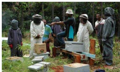
Training of youth in bee keeping

The youths have also adopted very simple monitoring and evaluation (M&E) systems to ensure that they continue to learn from and improve their activities. Various methodologies promote simple tracking and assessment of their projects: