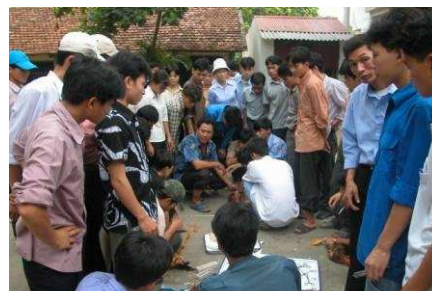
Một buổi thực hành lớp Chăn nuôi thú y của trường