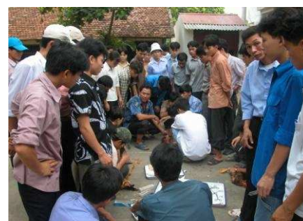
A hands-on session in an animal health training course