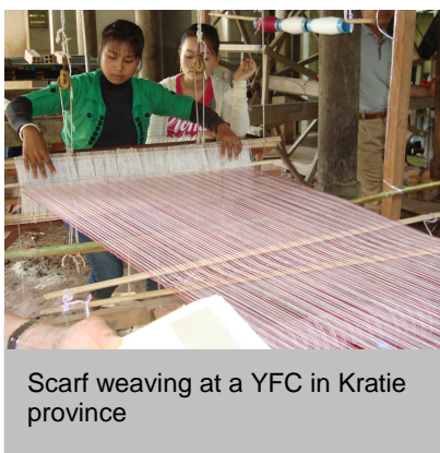
Scarf weaving at a YFC in Kratie province

Initially, the project formed 16 YFCs with 408 club members, of whom 149 were women. Each club received approximately US$100 from the project to start its activities, as well as a three-day management training for the club leaders on leadership, association management, coordination and bookkeeping. Technical training has also been provided to the club members – for example, on chicken and pig raising and vegetable growing. If