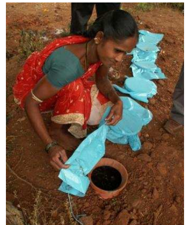
A trained young woman preparing bio-fertilizers with local bio waste and materials