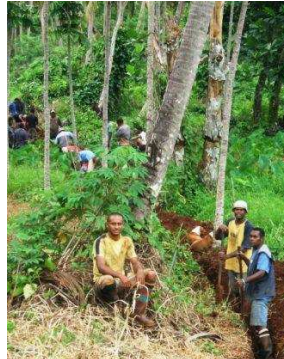
A group of young farmers on their farm in Keka village

The involvement of youths at all stages of a project is important. It promotes ownership and is a great source of learning as they grow to take up development responsibilities and contribute towards their community's survival. It is also important that communities, leaders and other stakeholders provide active guidance and support throughout the process.