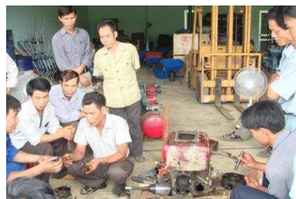
Lễ trao giấy chứng nhận tốt nghiệp