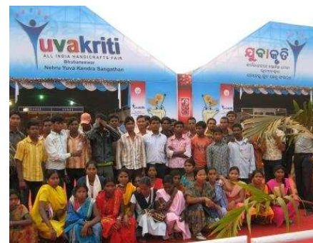
Tribal youth from the programme villages attending the National Youth Festival 2010 in Bhubaneswar, India

Five young men and women were selected from each village to be trained in these five skill areas. As para-professionals, these village volunteers are trained in regular intervals. These young volunteers are learning improved practices in agriculture, horticulture, livestock rearing, accounting, management, improved health care practices, good governance and other relevant topics. The training includes methods of facilitation and mobilization to support the communities in their respective areas.